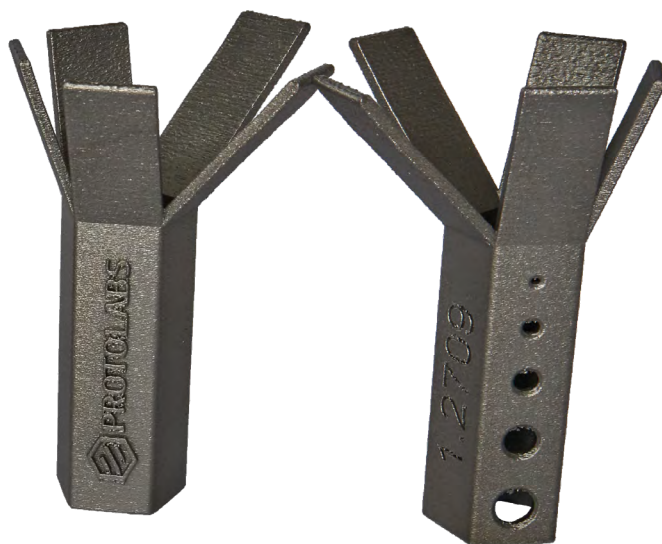
Normal Resolution 60 µm