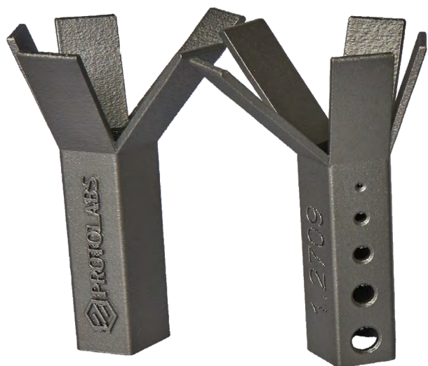
High Resolution 40 µm