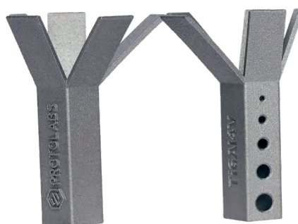
High Resolution 30 µm