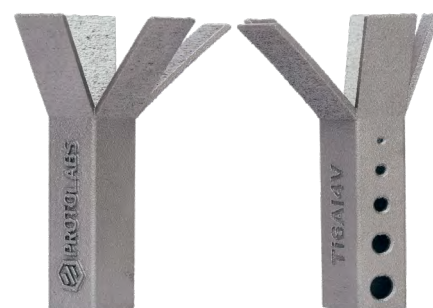
Normal Resolution 60 µm